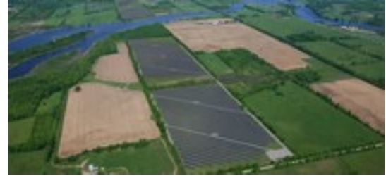
One of Recurrent Energy's Ontario solar farms

These commercial scale solar farms are a result of the provincial government's direction to increase renewable energy and what is called "distributed" power – or power that is generated from many small sources distributed around a region, rather than from a few very large centralized sources. These solar farms have a built capacity of about 10 MW, in comparison with built capacity of the Darlington Nuclear Power Station which is 3,500 MW.