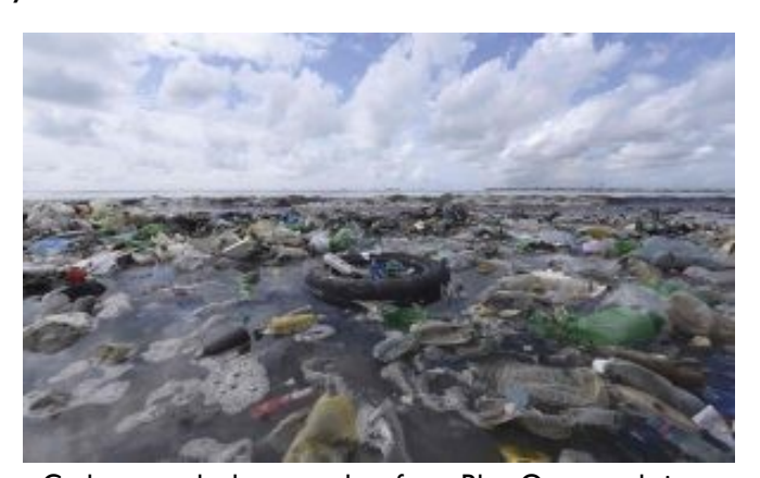
Garbage patch closeup, taken from Blue Ocean website.

It is estimated that 80% of the debris in the garbage patch comes from land-based activities and the other 20% from marine sources, such as boaters, offshore oil rigs, and large cargo ships. Because it floats, and is not biodegradable, plastic debris makes up most of the patch. The patch is not a solid island, but is described as a soup or a cloudy mass of tiny bits of plastic with bigger pieces of waste mixed in. Some sources say it is 9 feet deep. The "soup" is comprised of the tiny pieces that result when plastic breaks down, as well as the microplastics that come from cosmetics or from synthetic clothes.