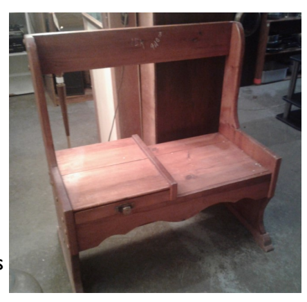
A deacon's bench that sold after being seen on Facebook Marketplace.

Facebook Market-place. The store is experimenting with using the Facebook Marketplace group to feature some of the more expensive or unusual items we have on hand. This feature of Facebook is available to anyone with an account to post their interest to buy or sell goods, and