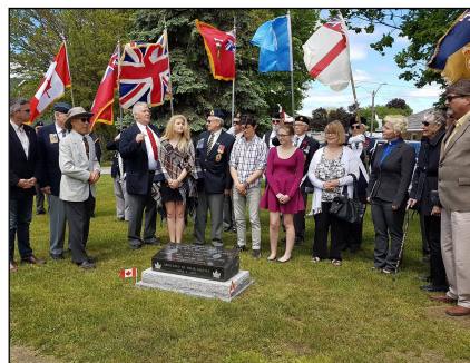
Unveiling the Vimy Memorial at Evergreen Avenue in June 2017.