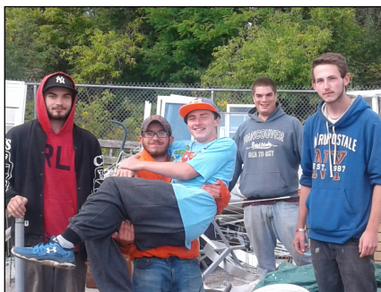
Some of our volunteers and work placements in the REAL Deal yard.