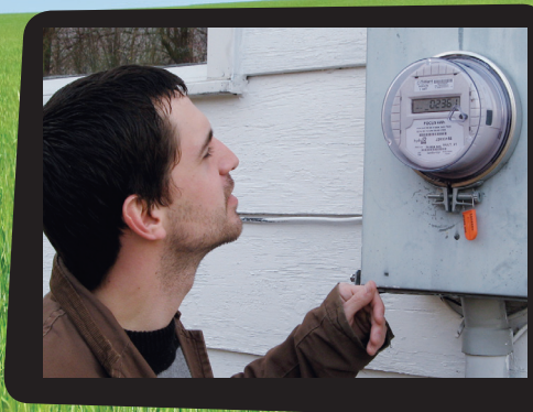
Helping residents address energy and climate change concerns