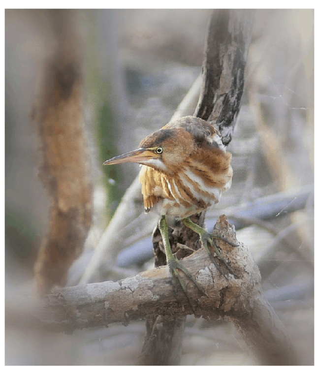
The Least Bittern

"I'll be returning to the swale in April or May, so watch for the April Update to find out the "REAL Deal" on me, including why protecting me is such a "Big Deal"!