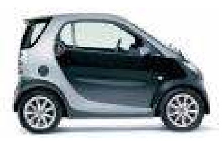
The Smart Car

of Being Green Festival in Lanark Village this summer. They had a Smart Car on display as well as a hybrid, and ..... a "clean diesel" Audi out of Europe. Transport Canada had tested this family-size sedan which cost it $28,000 to buy by taking it on road trips from Toronto to Vancouver and Toronto to Charlottetown. The car is rated at 101 mpg. The road trip to Vancouver was before the recent wollop in gas prices, but it had cost them $83.46 for that trip. On the trip to Charlottetown, which is all downhill, the car achieved a milage of 114 mpg. Can you buy this car here yet? No. John Neufeld of Transport Canada said that while Transport Canada had approved it for import, the car manufacturers say the North American market won't demand such cars until gas hits $2/litre and so won't be bringing in such cars. REAL is sending a letter to Audi recommending they reexamine this position.