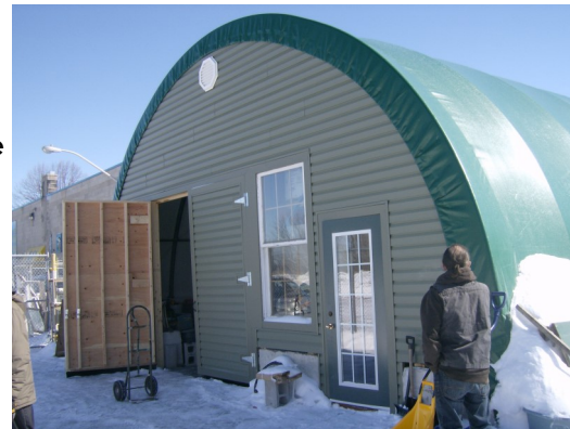
The coverall is an immense improvement on the store's accommodation of renovation supplies and some furniture.