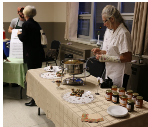
A well-received addition to the dinner was the four appetizer-tasting stations.