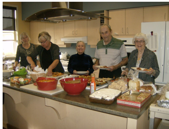
Some REAL members enjoying the potluck at our June 15 AGM at the SFCHC.