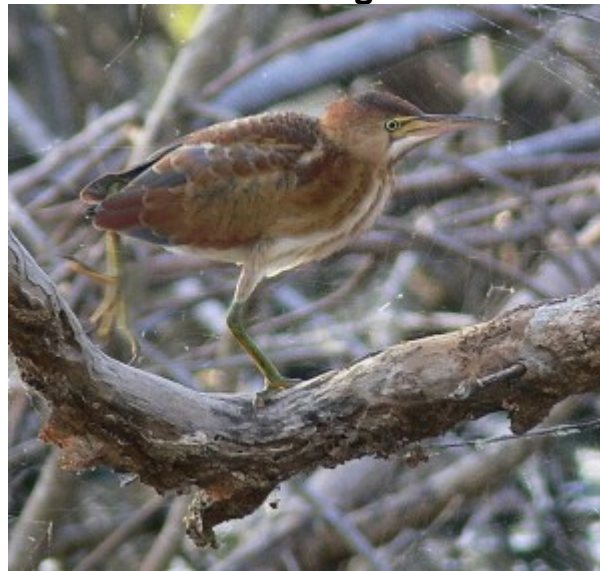
Least bittern.

Some of you may recall that when REAL first moved to our 85 William St. W. location there was concern over local populations of the least bittern, the smallest bird in the heron family. It was found to nest on small grassy islands out in the swale behind the property.