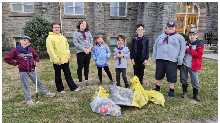
2nd Smiths Falls Cubs cleaned up downtown.