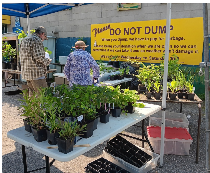
Customers making their selections from the native plants brought in from Natural Themes, Frankford.