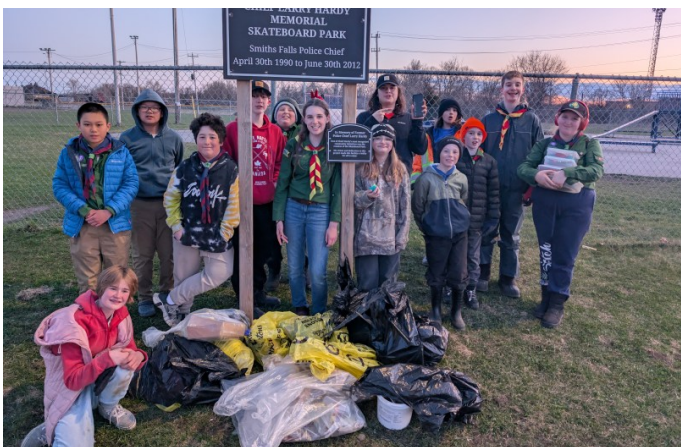
2nd Smiths Falls Scout Troop on Earth Day, April 22.

Groups participating included the BBBS Youth Centre, the SF Bears U13B Team, 2 nd Smiths Falls Cubs, 2 nd Smiths Falls Scouts, Beavers, Garbage Warriors, Smiths Falls Paddle Pals, the Church of Jesus Christ of Latter Day Saints and three schools: SFDCl, St. Francis and Chimo. Huge thanks to the individuals and families that committed to coming out also, we'd be sure to miss some names if we tried to list them. We appreciate your community spirit. We also know there are lots of people who pick up year round while on their walks, and that is admirable as well.