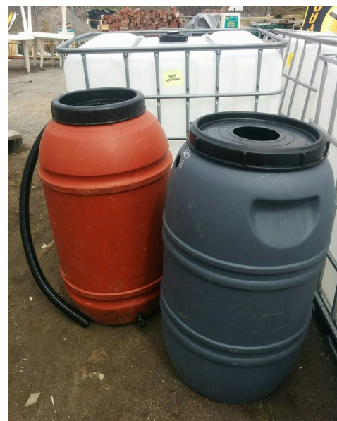
We still have two 1000 L rain tanks, and some ugly duckling terracotta or black rain barrels to sell.

An extra 60 barrels were ordered to sell through the REAL Deal store over the summer. The terracotta barrels ($60) and black barrels ($55) still available at the store are the ugly duckling barrels – a little more marked but perfectly usable and $10 cheaper than