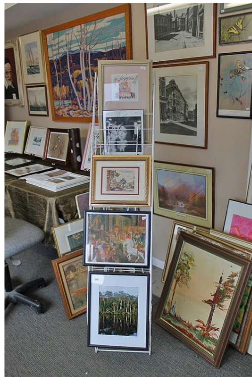
Some of the art on sale at the REAL Deal during our special annual exhibit. Most of these were pieces we have not had space to display in the store before now.

While we did not sell as much as we had hoped, we did identify two pieces of substantial value. We are in the process of getting these pieces into the appropriate hands for sale in the right market. Most of the art that did not sell this year has been placed throughout the store, so you can still come take a look if you didn't get a chance earlier. We will put more out as space becomes available.