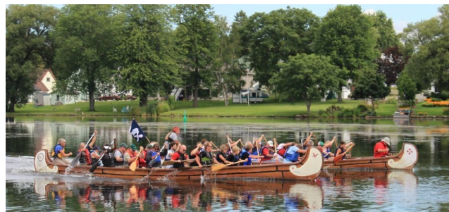
One of the Paddlefest 2015 races in Smiths Falls.