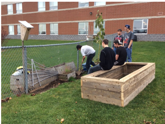
Top Left: Drummond Central School's pumpkin patch. The grant allowed them to purchase rain barrels and other supplies.