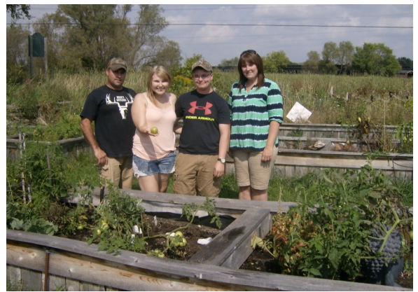
The REAL Community Garden includes 11 plots and a Stone Soup sharing plot. .

Representatives continued to make presentations to area municipal councils outlining how REAL can help them achieve their environmental goals. As a result, our organization receives financial contributions from The Town of Smiths Falls, the Township of Montague, and the Township of Drummond North Elmsley.