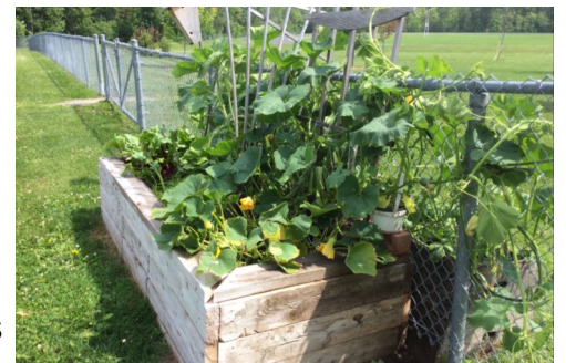
Upcycled raised garden bed at SFDCL.

Results of the eight $250 REAL Action grants awarded in honour of our 25th anniversary were reported throughout 2015. Community gardens, a water bottle filling station, an e-waste collection program, a high school winter field camp and a tree in memory of female victims of domestic violence were the community projects helped along. Thanks to longtime supporter Tom Foulkes for funding our 25th anniversary activities.