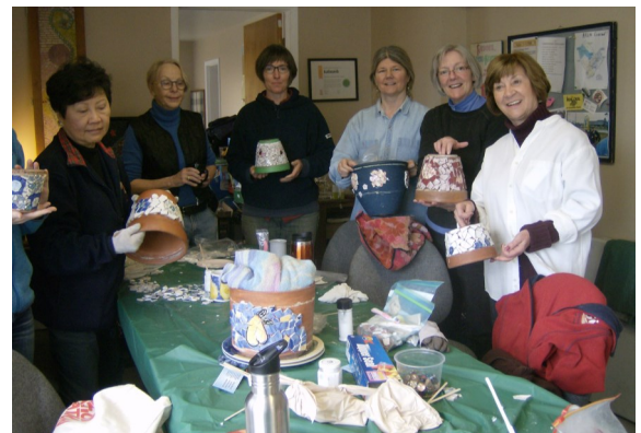
Workshops encouraged repurposing materials into new items as a way of reducing waste.

This year we launched a revamped Wordpress website, and started using MailChimp to manage our email communications. REAL maintains three Facebook pages for REAL, the REAL Deal Store and the Community Garden. We produced five eight page newsletters, and used local media to encourage environmental actions.