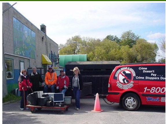
CrimeStoppers and REAL volunteers with some of the televisions, computers and other e-waste collected during the October event.