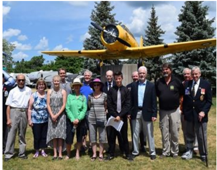
Some of the guests at the June 4 Evergreen Avenue Celebration when five new granite stones were dedicated.

farm. The trees initially prospered, but now only nine remain. Today 300 saplings from these Vimy oaks are growing in a Hamilton nursery. A new oak forest will be created at Vimy Ridge in 2017 from these saplings, and several Canadian communities, Smiths Falls included, were selected to receive a sapling. A group of SFDCI students will be in charge of the planting and nurturing of one of these seedlings.