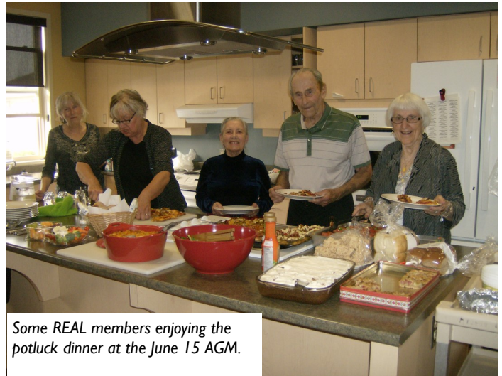
Some REAL members enjoying the potluck dinner at the June 15 AGM.