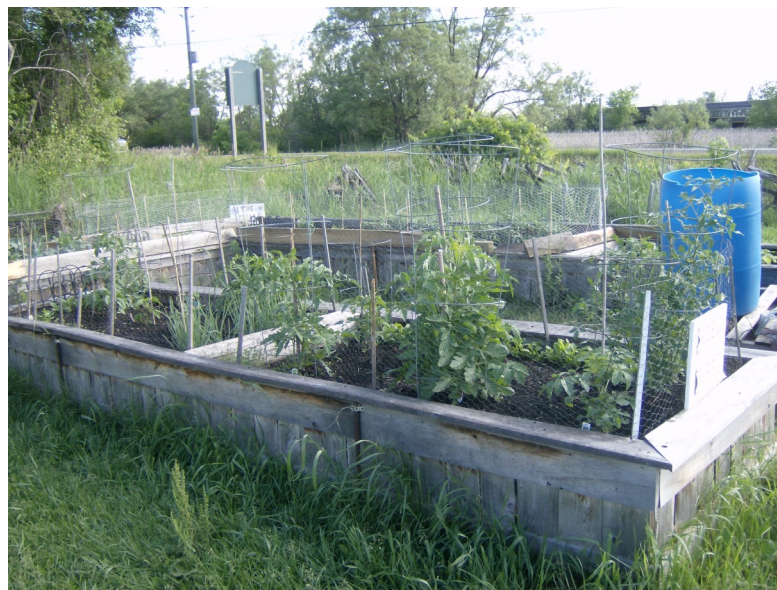
Four new gardeners have joined the REAL Community Garden this year. Each person's plot is for their own use. If you would like to sample produce, help yourself to the box labelled "Stone Soup Sharing Plot."

Despite the prolonged dry spell, the gardens appear to be doing well, and we have had no reports of marauding critters yet. Several participants have put chicken wire around their plots to discourage animals from snacking on their produce.