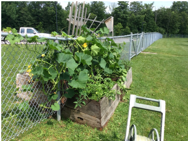
Above: A recycled planter created at SFDCI in 2015. Below: Carleton Place High School Enviro Project making a meal at their winter field camp.

The application process will be a simple one. Full instructions are available on REAL's website, www.REALaction.ca . Applications will be accepted until March 1, 2017, and winners selected by March 31. Projects will be announced publicly by Earth Day, April 22, and should be completed by August 31, 2017.