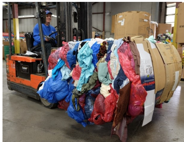
Textiles donated to the Salvation Army in Oakville baled for sale to private companies.

Interesting changes are happening in the recycling of textiles, which is a good thing, because they are becoming a big problem. We recycle a lot of other consumer products, but for the most part this one has been missed. Textiles have one of the poorest recycling rates of any reusable material. In New York City, for example, clothing and textiles account for more than six percent of all garbage, which translates to 193,000 tons annually. While many of us wouldn't think about not donating a used item of clothing to a local charity, about 85% of the clothes we discard are ending up in the landfill (or in some places, the incinerator), meaning just 15% are recycled or reused. There is a misconception that a discarded clothing item must be perfect to be of any use.