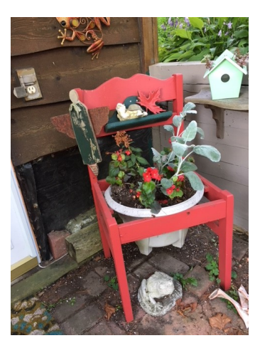
Some garden art from free items at the REAL Deal.

I took an old chair from the free table at the REAL Deal and painted it red, added a small beaten up shelf to the backrest and replaced the upholstered seat with a large planter for flowers. I added a few décor items found in a box on the Free Table to the shelf and Voila! This decorative planter still sits beside my door at the cottage.