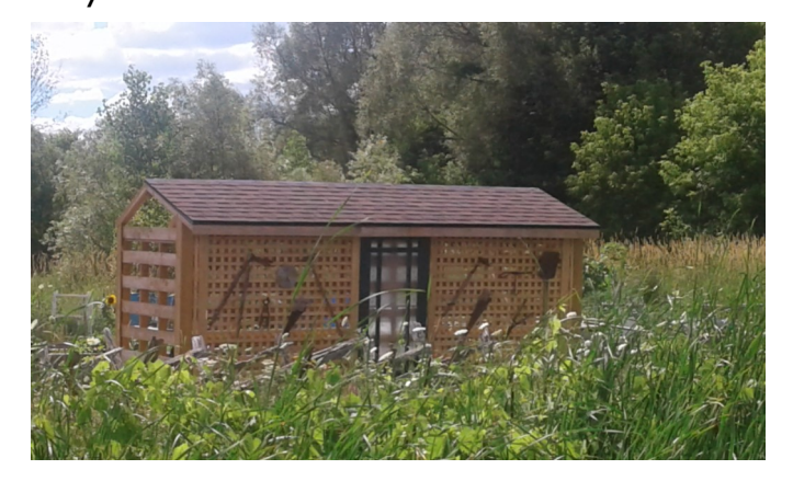
Some purchased lattice, rusty old tools and a donated old door were used to decorate the compost shelter.

Our Compost Demonstration Site continues to progress. We installed some lattice on the side of the compost shelter facing William Street, and got a good price from Lanark Cedar by purchasing seconds. An old wooden door makes it look more like an actual shed. We made use of a number of rusty old tools we had accumulated to decorate it.