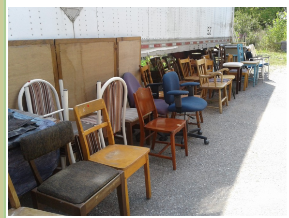
Chairs R Us? We had at least 60 dining room chairs accumulated. Many were 50% off. We made use of the area directly behind the store to display them as well as other furniture.

The REAL Deal also offered 50% off certain items: medicine cabinets, bifold doors, mirrors, sinks and select furniture, and some deals on mason jars, art, tents, seeds, photo frames and even free lightbulbs. Oddly enough, lots of doors sold that day, too.