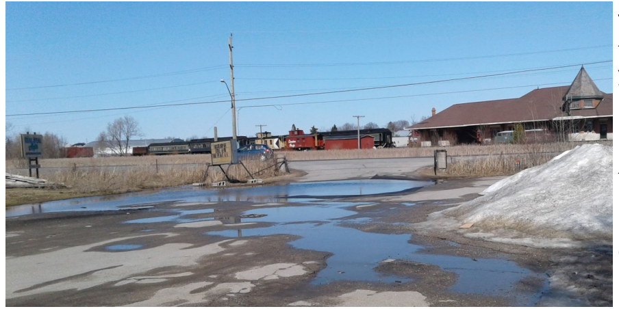
REAL's own "Lake of Shining Waters" at the entrance to the parking lot. The surface below the lake is without potholes, and the water is moving towards the ditch along William Street.

Our annual second chance art sale is tentatively May 2 - 11. The sale is an opportunity to display some of the interesting art pieces that have been donated to the store. There will be lots of wall art: prints, acrylics, and oils, as well as a few other sculptures, pottery and the like. If your mom is an art lover, pick her up something for Mother's Day!