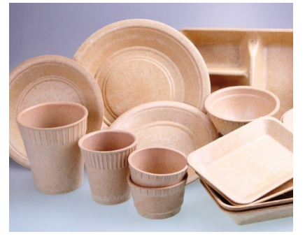
Some bamboo food containers.

In Europe, biodegradable means that after 90 days in an industrial compost facility, 90% of the material breaks down to particles less than 2 mm size. This will not happen in a backyard composter! Even in municipal composting systems, some bioplastics, such as biodegradable bags, will still have to be picked out.