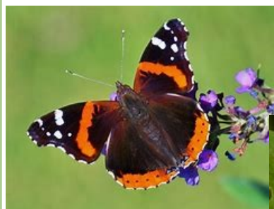
Red Admiral Vanessa atalanta