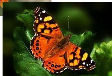
Painted Lady Vanessa cardui