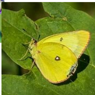
Clouded Sulphur Colias philodice