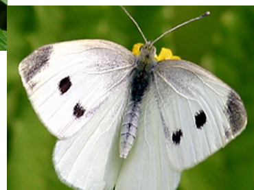
Cabbage White Pieris rapae