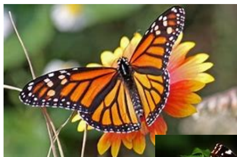
Monarch Danaus plexippus

The Monarch Teacher Network is a collective of educators and nature enthusiasts who teach and inspire people to connect with nature. One of their resources is a list of six common butterflies in Ottawa. Each butterfly comes from a distinctive looking caterpillar, and has it's favourite host plant and nectar plants. For example, the Eastern Black Swallowtail lays its eggs on dill, fennel or wild carrot, and likes to feed on butterfly bush and orange butterfly weed. See the entire poster. But in the meantime, here are six butterflies common in this area that you could easily learn to identify.