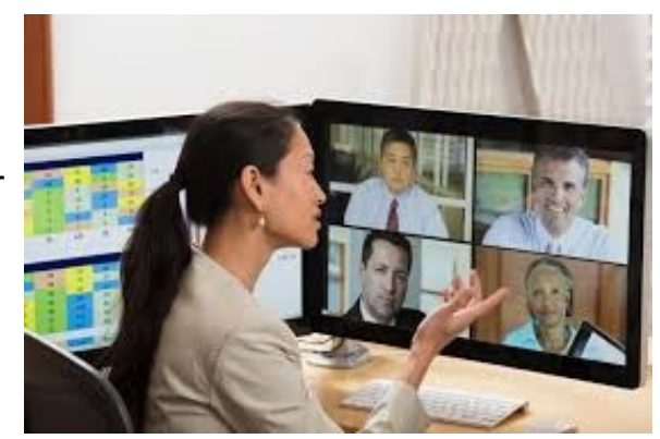
More people have learned to use and appreciate videoconferencing.

Others are more optimistic that some lessons will come from this pandemic that will help us deal with climate change. One notable lesson is that "if you wait until you can see the impact, it is too late to stop it." Some changes might be a drop in business travel now that businesses see what can be accomplished remotely, a reduction in leisure travel, countries producing more of their own goods so they are less vulnerable to long supply chains, and more people working from home, all of which could reduce dependence on oil and reduce greenhouse gas emissions substantially. This <u>Yale Environment story</u> is a longer than the others but well worth a read