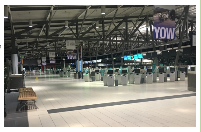
An eerily empty Ottawa Airport during the COVID crisis. Will more people choose not to travel for business or pleasure?

This Los Angles Times story wondered if "the unprecedented global mobilization to slow the pandemic might help pave the way for more dramatic climate action", and asked eight experts what a coronavirus-like response to climate change would look like. Read their thoughts here.