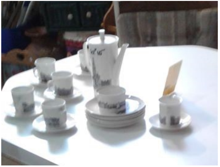
This photo was taken to show off the table on Facebook Marketplace, not to highlight the tea set, but gives you an idea of what it looked like.

We decided to meet in Carleton Place for lunch at a small restaurant on Bridge Street. I landed into the cafe, pot in hand, for our lunch. I had decided if the pot was right, the whole set would be right. The table was so small we had to ask to have the vase and flower removed so we could set the pot down, and laughed and giggled while entertaining everyone around us.