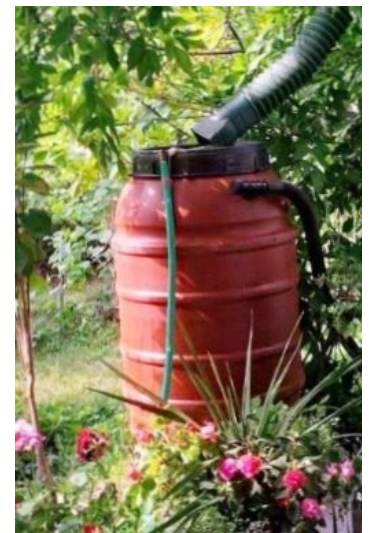
Terracotta and grey barrels seemed to be equally popular.