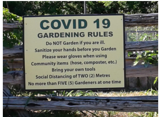
The sign by the entrance to the REAL Community Garden.

When the Ontario government directed that all recreational facilities must close to reduce the spread of Covid-19, it had lumped community gardens in with facilities like arenas, parks and swimming pools. After some lobbying by garden groups that community gardens were more an essential service than a recreational pursuit, the province declared an exemption for community gardens on April 25. Local health units were tasked with establishing guidelines for the gardens in their communities. The Leeds, Grenville and Lanark District Health Unit released their list on May 1. See the guidelines here . All gardeners have been made aware of the safety instructions and REAL has posted a sign specifying the rules. On June 23 the maximum number of gardeners was raised to 10.