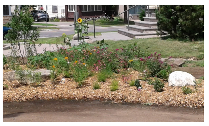
The bed closest to the library about 10 days after planting. Eventually the area surrounding the beds will be grassed.

We are grateful to the local media for their great coverage of the two work days: Hometown News, the Record News, Lake 88 and Cogeco Your TV. They managed to create a good buzz about Depave, and we had lot of positive and encouraging comments from the public.