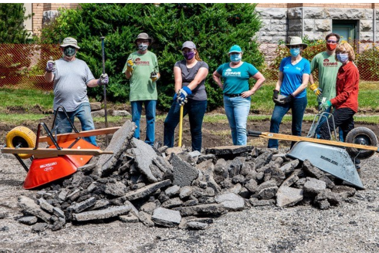
One of the four teams who volunteered to remove a section of Daniel Street on June 19. About one third of that block was removed by hand.

By engaging community members in removing the pavement and the planning, we get people talking about the issues, create ownership, and show people that they can make a difference in their communities. Removing impervious surfaces helps restore the natu-