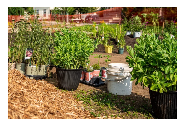
Eight shrubs and 196 plants sourced from various local establishments as well as local gardeners waiting to be planted. Four native trees will be added in the fall.

REAL engaged Lashley and Associates to create the garden plan for the beds, but sourcing the specified plants was a challenge this year due to supply issues, and the increased public interest in gardening. Donna visited most of the area garden centres to collect the varieties, sizes and quantities of plants needed. We were fortunate to fill in some of the blanks by putting out a call for gardeners to contribute certain plants from their own gardens (see last page).