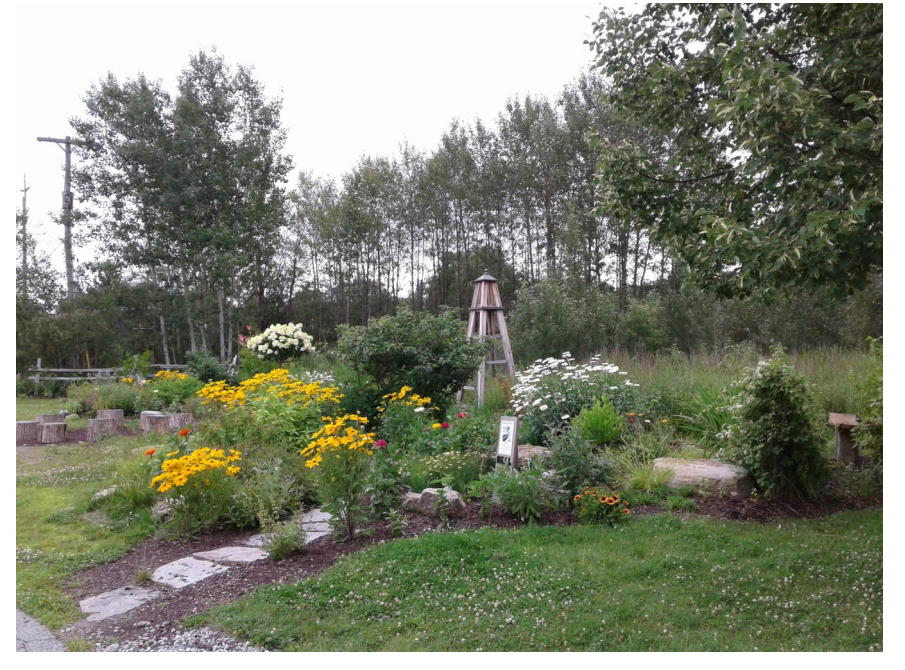
A view of REAL's Monarch Garden in mid July 2021.