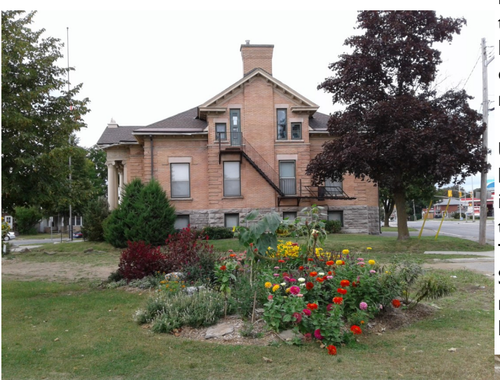
The bed closest to Emsley St. Sept 11. The other bed is the same size but closer to Beckwith St.

We are still wrapping up some details for our Depave Daniel Street project, but it won't be truly finished until next spring.