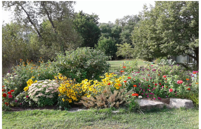
REAL's Monarch Garden emphasizes bee and pollinator friendly plants.

Yes, your garden may be green but you can make it greener! Here are some gardening practices you can easily work into your gardening plans to minimize your environmental impact. Why not try two or three new strategies this year?