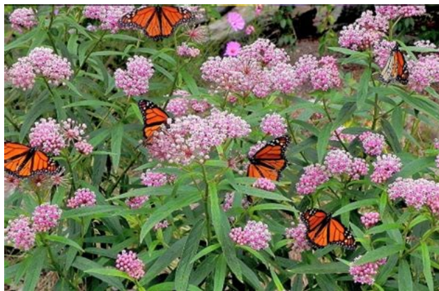
Swamp milkweed. ( Asclepias incarnata )

For more information about native plants you can watch this informative video on growing native plants with Sean James https://www.youtube.com/watch?v=jUAjaOb4nYA .