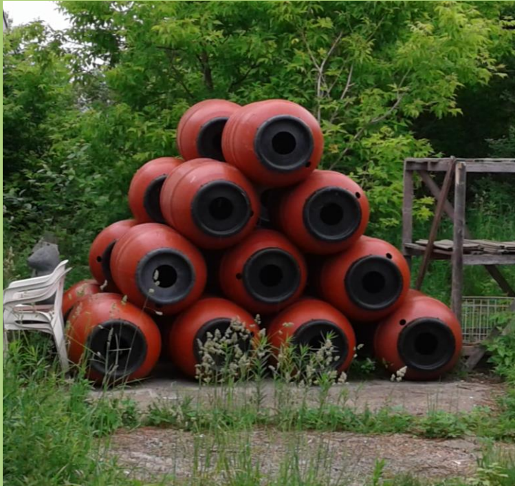
Rain Barrel Sales