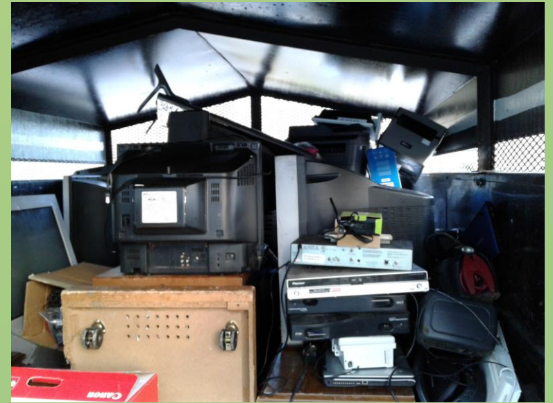
Electronic Waste Depot