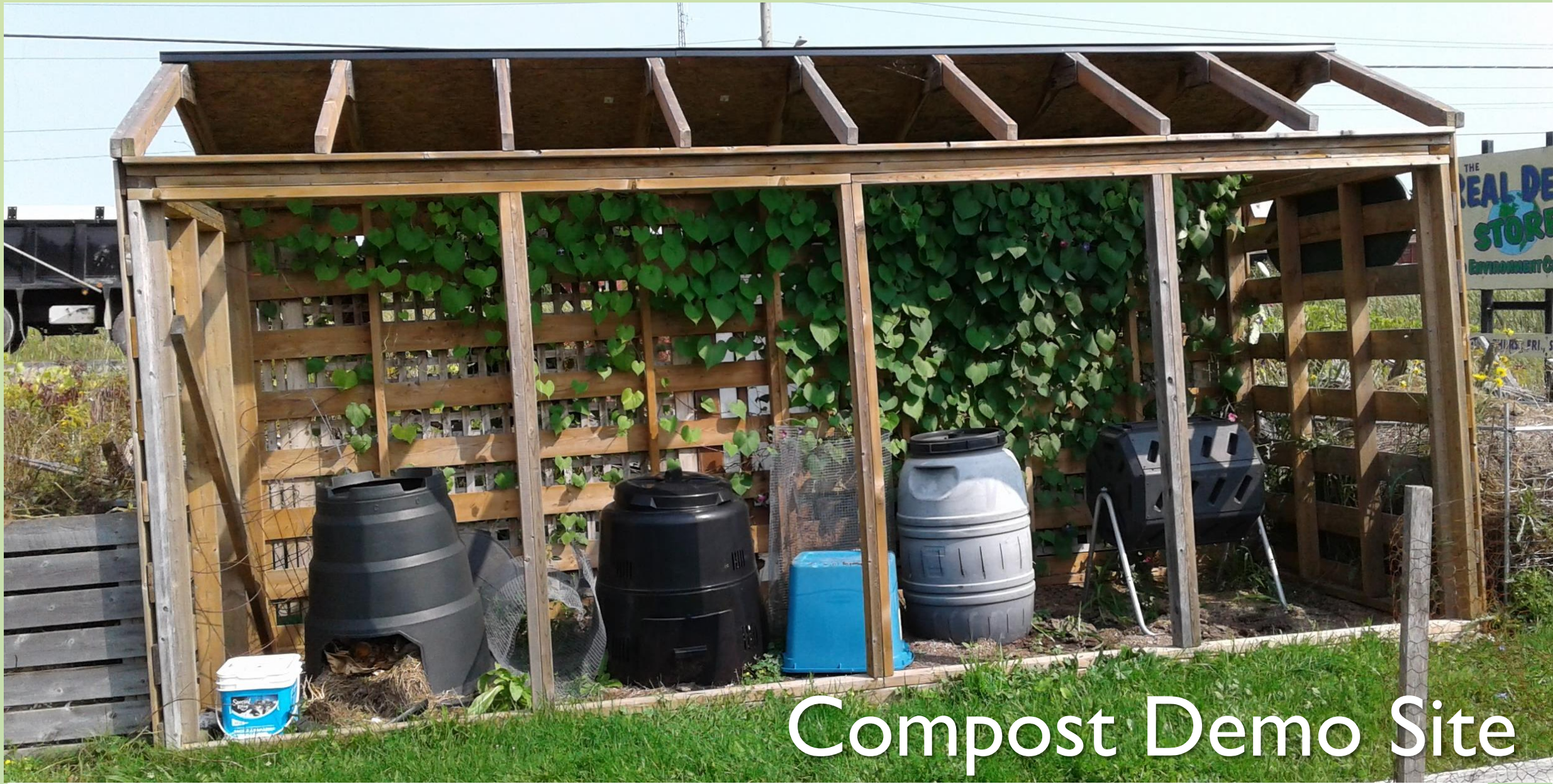
Compost Demo Site