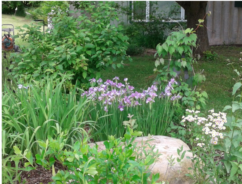
A springtime view of one of REAL's monarch gardens on the REAL Deal site.

Threatened with widespread habitat loss, increased use of pesticides, and climate change impacts, monarchs have suffered a population decline of 90% in recent decades. For monarchs, the decline is linked to a decline in milkweed, the only plant that monarchs use for laying their eggs and the only food that monarch caterpillars eat. Without milkweed, monarchs can't complete their life cycle and populations plummet. The Canadian Wildlife Federation is restoring the monarch's habitat by engaging communities in recovery