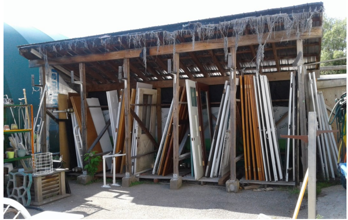
Exterior doors and other materials like sinks, windows, lumber and garden furniture area out in the yard.

and the dome, just off the parking area.