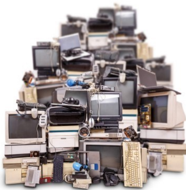
Canadians have now recycled 1 million tonnes of electronic waste through EPRA programs.