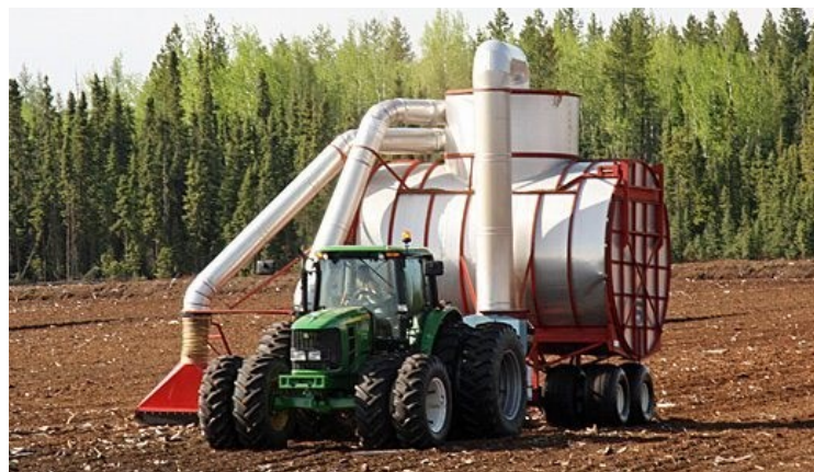
Commercial peat extraction. The area is drained, the surface vegetation is scraped off, the decomposed plant layer is left to dry and then vacuumed off.

Planted: https://allplants.com/blog/lifestyle/why-is-peat-compost-being-banned