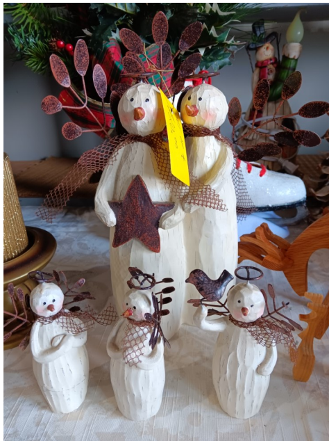
Some of the many cute decorations donated to the REAL Deal.

We had an incredible pile of Christmas items to unpack and price this year, more than we have ever had. Yet every Christmas seems to be a little different.