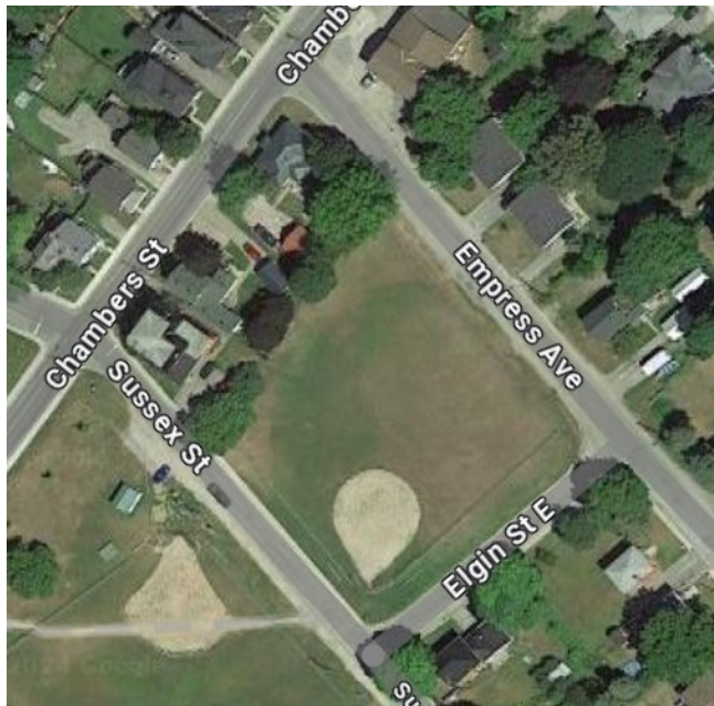
The little forest will be planted at the north end of Corbett Park

Corbett Park in Smiths Falls will be a hub of activity in 2024 with the planting of 300 trees and the creation of a mini forest in Smiths Falls. The mini-forest will also be a great project to mark REAL's 35th anniversary (like the butterfly garden was for our 30th anniversary!)