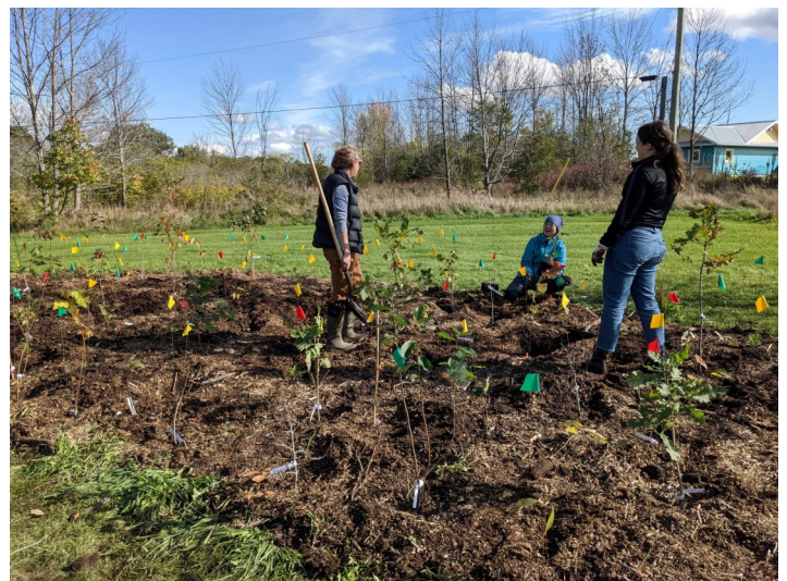
Volunteers planting one of the many little forests that have been established in Kingston. The colour coded flags are used to guide the dense planting of approximately 40 different species. REAL will be making use of the experience of the Little Forests Kingston group for Smiths Falls' first little forest.

Here's an interesting CBC article on Mini Forests: https://www.cbc.ca/news/canada/prince-edward-island/pei-charlottetown-mini-forest-method-1.6991637