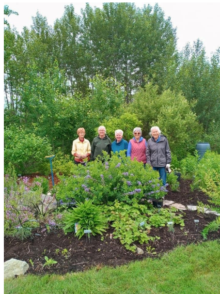
Some of the ladies who tend the gardens at the REAL Deal and at Town Square once a week, usually Tuesdays.

Growing certain species of milkweed can be a real challenge, as they come up very late in the season. We ordered in five different varieties for our sale: Poke milkweed, swamp milkweed, Sullivan's milkweed, common milkweed