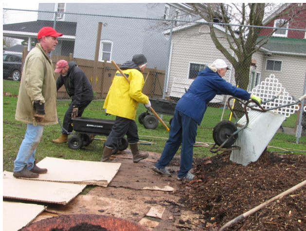
Volunteers worked one strip at a time to lay down layers of cardboard, leaves, compost and wood chips to establish a soil layer for our mini-forest to be planted in October.

REAL has received no special funding for this project, and are paying for it from our reserves because we really wanted to see it happen in our 35 th anniversary year. If you are interested in supporting this project with a financial contribution, you may do so at CanadaHelps.org . There is a "Mini Forest" option on the drop down menu.