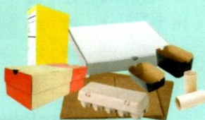
Cardboard and boxboard