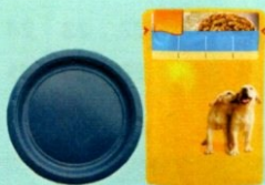
Paper laminate packaging