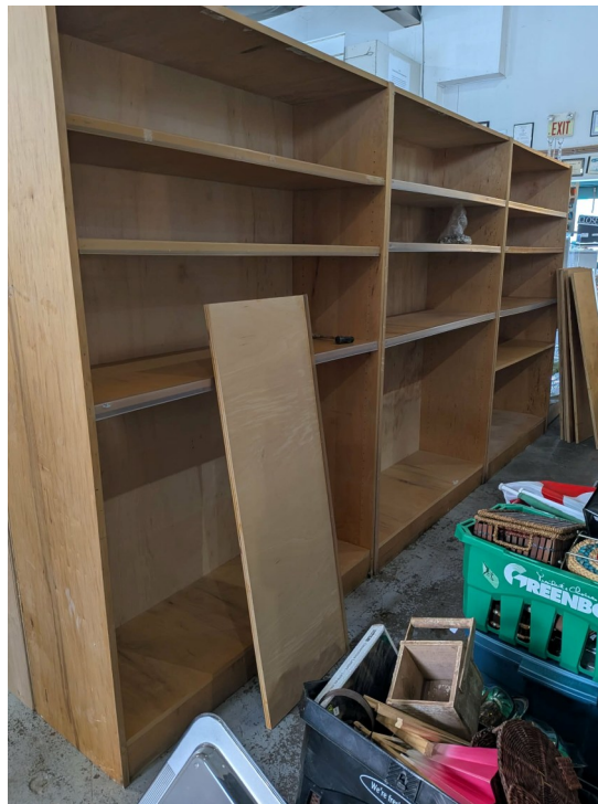
Sixteen new 4 foot wide shelves were installed and loaded up while the store was open. We took the opportunity to use some of our older, better shelves in other departments: vintage, the Book Nook and appliances in particular.

Lease for the Building. REAL will soon be signing a new five year lease with the Town of Smiths Falls for the use of the REAL Deal building. This is good news for us as it gives us a chance to plan more effectively. The Town lets us use the building rent free, and REAL pays the utilities. This has been the arrangement since 2008 when we opened at the 85 William St. location.