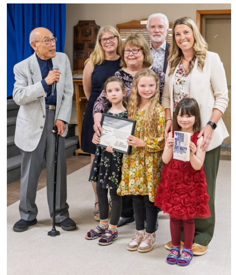
Montague teachers and students receiving their environmental Award from REAL